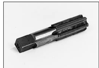
Fig. S88 — ISO 6149-1 Straight Thread Port Tap

ISO 6149-1 female straight thread port taps are available for M8 to M48 port sizes. Taps are bottoming type and made from high speed steel.